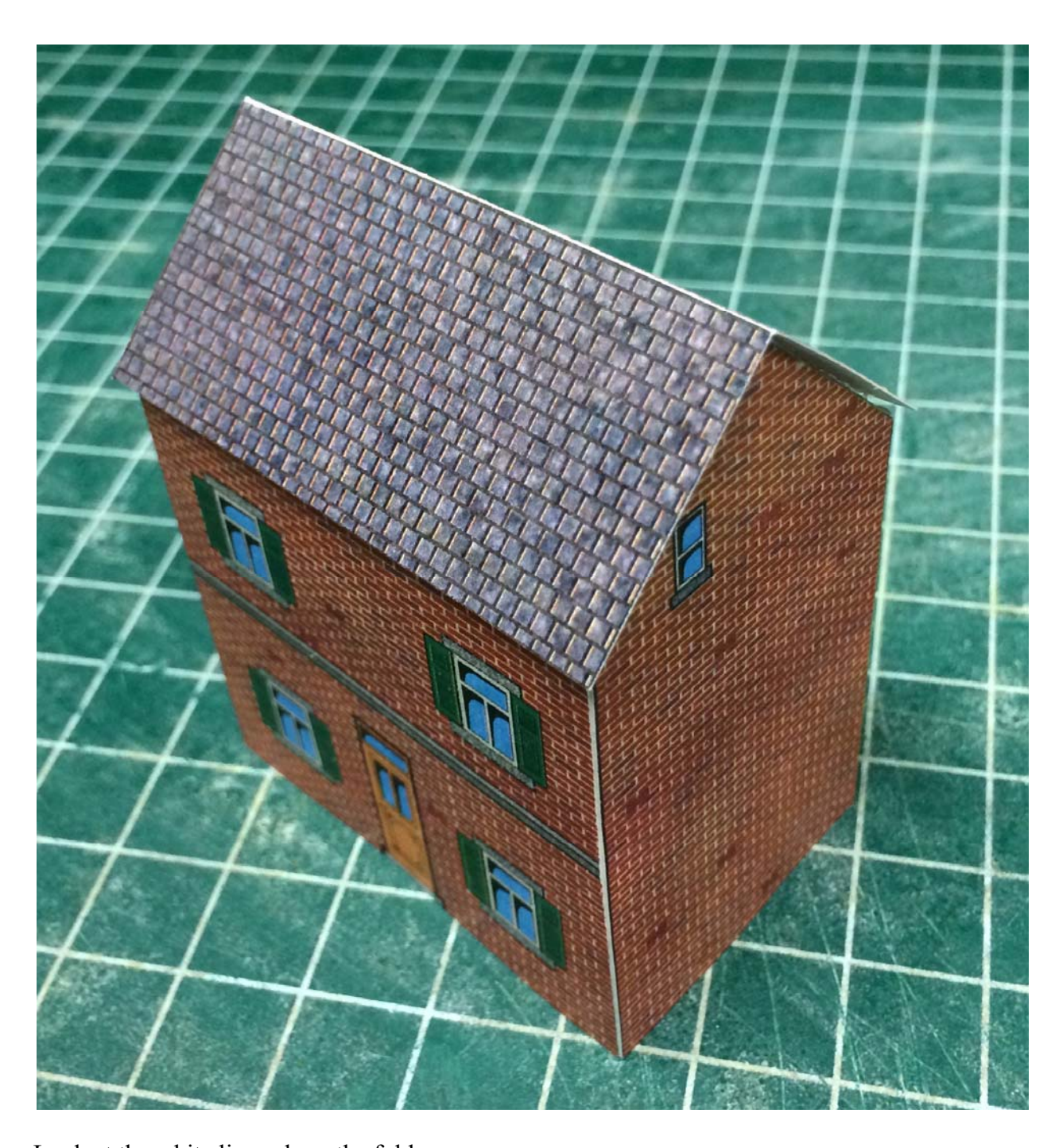
Look at the white lines along the folds.