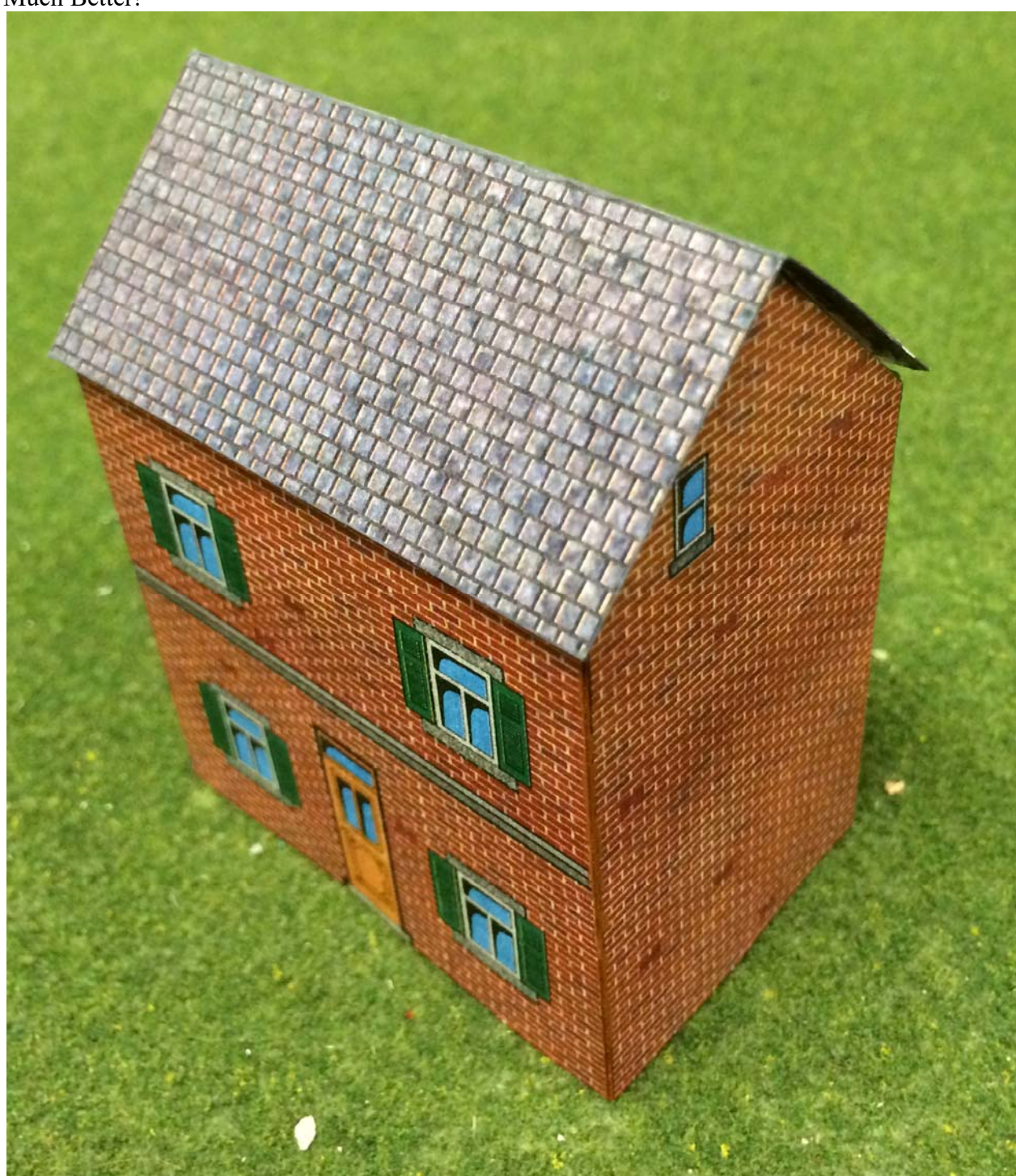
Painting the Inside of the Ruins

The ruined buildings which come with most of the models have their exteriors printed, but not the reverse, interior sides. If you want to paint the insides a dark gray or brown to give a 'burned out' look to the inside of the ruins, the easiest way to do that is to paint the unprinted side of the paper BEFORE you cut out the ruin. This is very quick and avoids any danger of