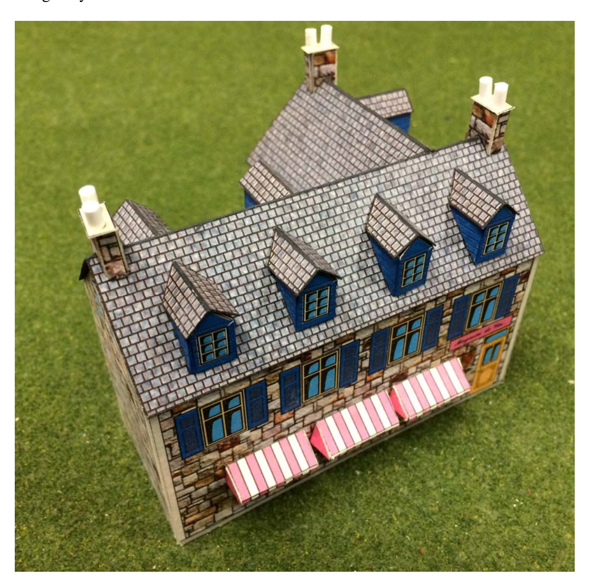
A little extra work makes a world of difference!

These can be a pain. Do doubt about it. Doing the dozens of dormers and chimneys in a European Village Pack is time consuming and by the time you get the last dormer done you'll never want to see another one again! But if you want a model which looks like more than just a cardboard box, I urge you to persevere and add the dormers and chimneys. No matter how nicely the artwork is done on a paper model there is no way to completely disguise the fact that it is just a flat piece of paper. Adding some three-dimensional elements like the dormers and chimneys will greatly enhance the look of the models.